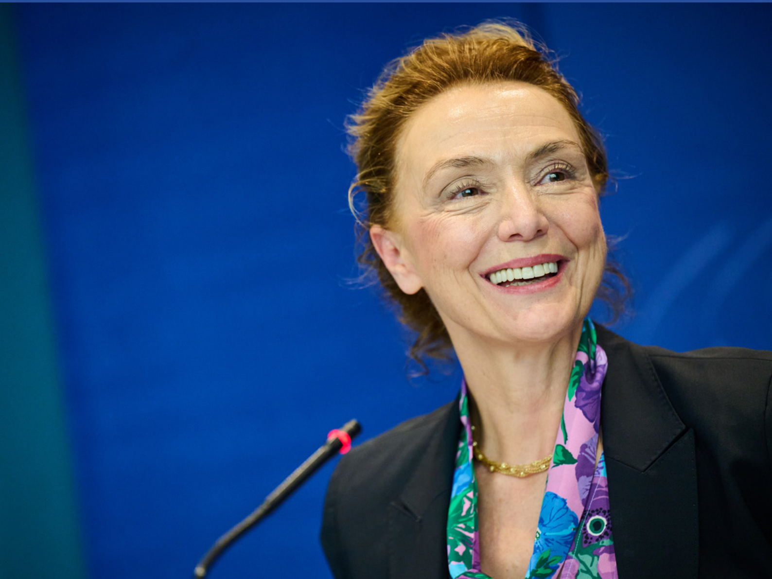
Marija Pejčinović Burić Secretary General of the Council of Europe